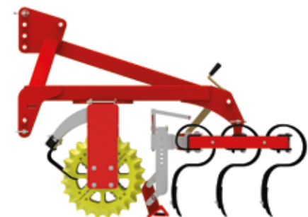
Avant 30-56 with tined unit and additional levelling bar between tines and roller