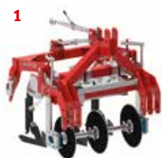
1 Cultivator 12 with enlarging of one tine with centred cutting disc