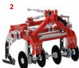
2 Cultivator 12 with enlarging by one tine with cutting disc left and right