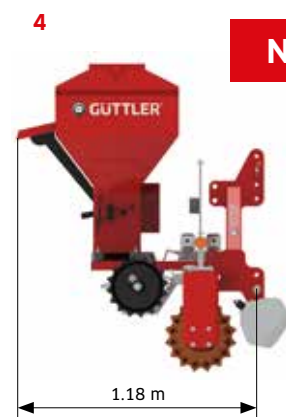
4 Console Pneumatic seeder behind the Prisma roller®